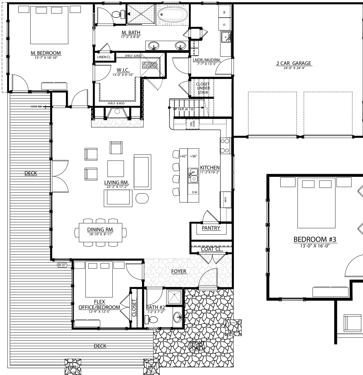
FIRST FLOOR PLAN HEATED/FINISHED: